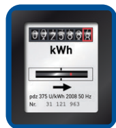
Existing Main Meter